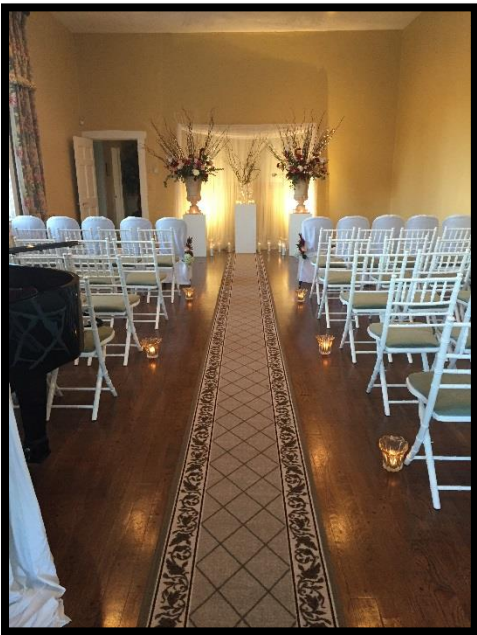
Photograph by Stone Blue Productions>